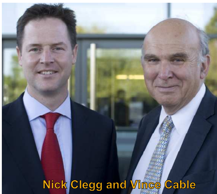
Nick Clegg and Vince Cable