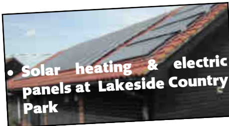
• Solar heating & electric panels at Lakeside Country Park

Tackling climate change requires more than the occasional fine words from the Prime Minister it actually requires practical action too. We can all do our bit by recycling, as using recycled material uses less energy than using raw materials.