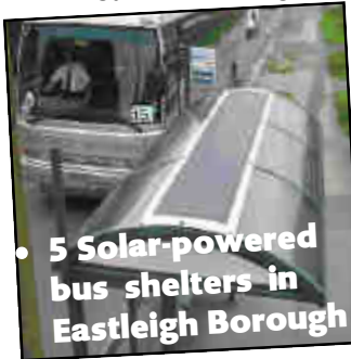
• 5 Solar-powered bus shelters in Eastleigh Borough

The next scheme is a combined heat and power plant at Fleming Park leisure centre, which will also provide heating for the Civic Offices.