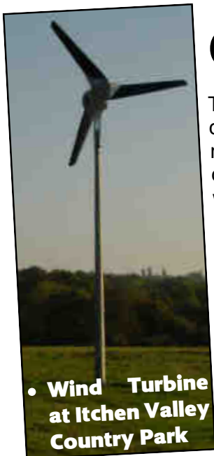
• Wind Turbine at Itchen Valley Country Park

Tackling climate change requires more than the occasional fine words from the Prime Minister it actually requires practical action too. We can all do our bit by recycling, as using recycled material uses less energy than using raw materials.